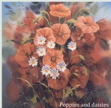
Poppies and daisies

In "Landscape Painting in Watercolour" Jeremy will demonstrate how to construct atmospheric landscape subjects using a limited range of carefully chosen colours. Jeremy will tackle some of the more challenging aspects of watercolour painting, from colour mixing and compositional arrangements to the use of washes and final finishing touches.