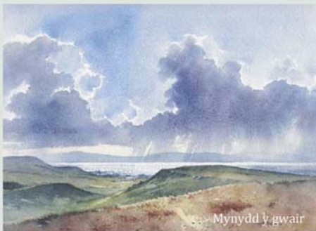
Mynydd y gwair

A popular course, please book early to avoid disappointment. Please remember to bring good sturdy walking shoes and outdoor clothing for this location-based course.