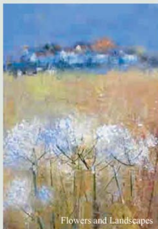
Flowers and Landscapes

Soraya is an encouraging and approachable tutor who teaches in an informal friendly atmosphere.